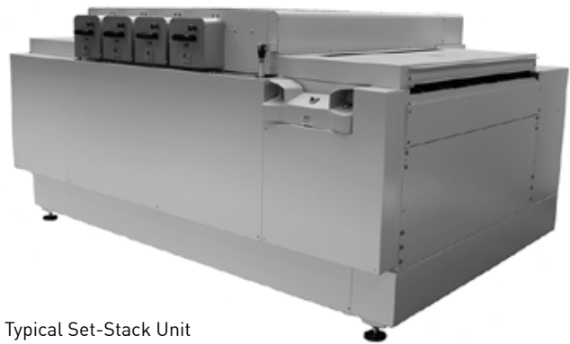
Typical Set-Stack Unit