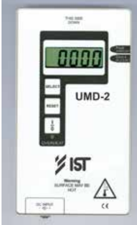
Measuring device UMD-2

All components of the UV unit are easily accessible and lamp units have quick release couplings for all services so can easily be removed for maintenance. Spare lamp units can also be supplied so that regular maintenance can be carried out off-line.